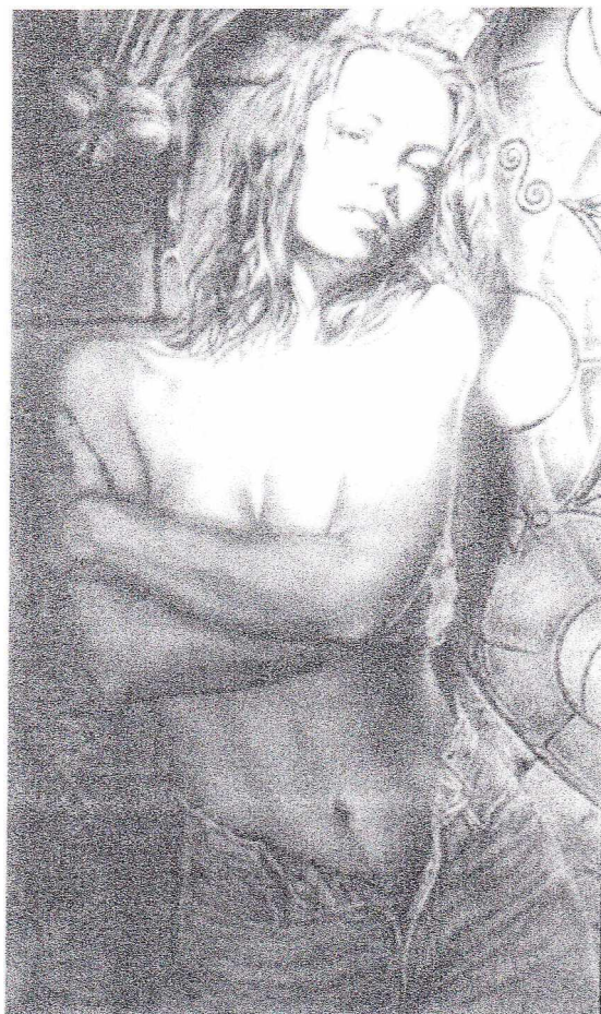
illustration